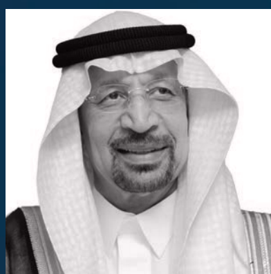
H.E. Khalid Bin Abdulaziz Al-Falih