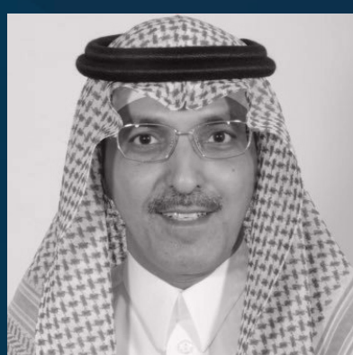
H.E. Mohammed Al-Jadaan