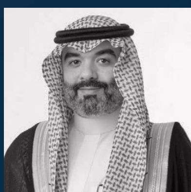
H.E. Eng. Abdullah AlSwaha

Minister of Communications & IT Saudi Arabia